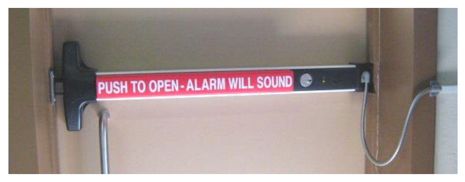
Installation will look similar to the above illustration